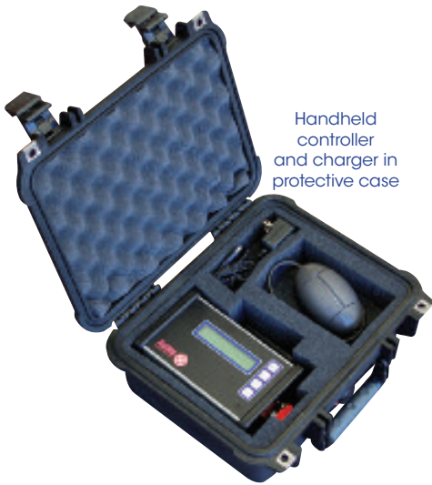
Handheld controller and charger in protective case