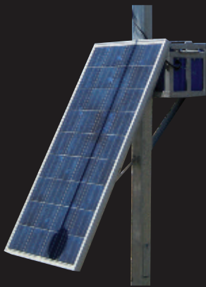
Solar module/battery configuration of AV-09-4WL Windsock Light

The AV-09-4WL can be installed immediately and requires no costly underground wiring. The complete kit comes packaged in a 155x69x76cm pallet for ease of shipping. Other configurations are available on request.