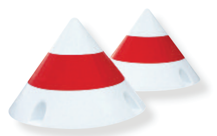
Graphics are permanently moulded into the product and will not peel off or fade over time